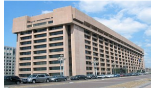
USPS HQ - Washington, DC USPS HQ office ~750,000sqft