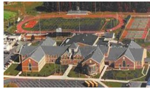
Southern Regional Schools High school, middle school & elementary school ~400,000sqft