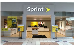
Sprint Stores - MD/DC/VA/PA/NC/IL/OH Coverage for CDMA, WiMAX & LTE 200+ stores nationwide