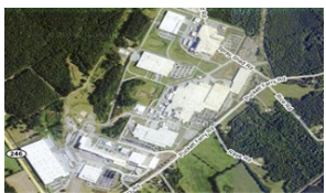
Fujifilm Campus - Greenwood, SC 11 Bldg manufacturing campus ~3,500,000sqft