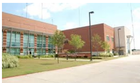
Cedar Hills School—Cedar Hills, TX 2 building facility outside Dallas ~200,000sqft