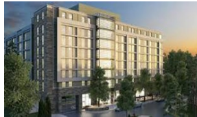
American University—North Hall Newly completed 8 story student housing ~110,000sqft