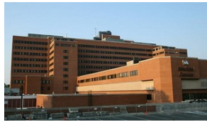
VA Medical Center - Durham, NC 12 story medical facility ~700,000sqft