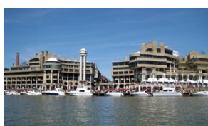
Kelley, Drye & Warren LLP Prestigious Georgetown Law Firm ~350,000sqft