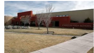
Carson City Schools High school & middle school ~500,000sqft