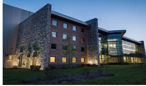
Howard County Government Multiple buildings across Howard County, MD ~400,000sqft