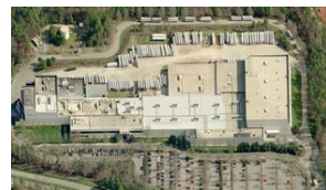
Kellogg - Cary, NC Food processing plant ~800,000sqft