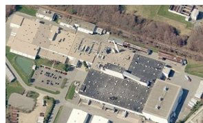
Nestle - Middleboro, MA Nestle Ocean Spray beverage plant ~660,000sqft