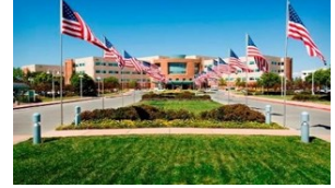
VA Medical Center 8 building hospital campus ~900,000sqft