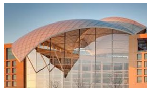
KIPP Schools - DC & MD 5 Schools located across MD & DC ~600,000sqft