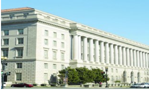
IRS - Washington, DC IRS office building in the heart of DC ~1,000,000sqft