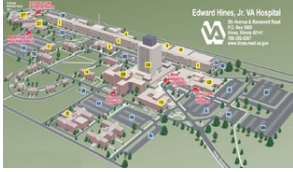
VA Medical Center - Chicago IL Historical VA hospital campus ~2,500,000sqft