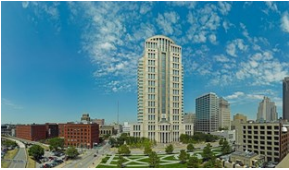
Thomas F. Eagleton Courthouse Federal courthouse ~1,350,000sqft