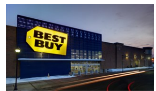
Best Buy Stores Coverage for CDMA & LTE 35 stores across multiple states