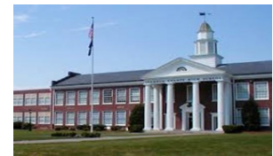
Loudon County Schools 15 schools in northern VA ~1,200,000sqft