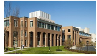
Fairfax County Courthouse Circuit & district courts ~500,000sqft