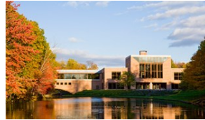
Dolce - Palisades, NY Hotel & training center ~600,000sqft