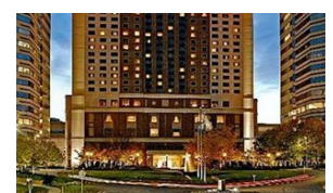
Marriott Ritz-Carlton, VA 10 story hotel & meeting rooms ~250,000sqft