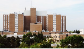
VA Medical Center - Milwaukee, WI 11 Floor medical facility ~700,000sqft