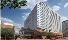
Hilton - Baltimore, MD 4 star hotel & conference center ~800,000sqft