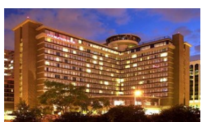
Doubletree—Arlington, VA 15 story hotel & conference center ~200,000sqft