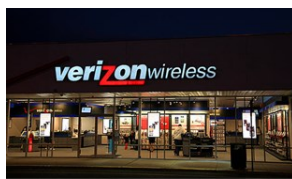
Verizon Stores - MD/DC/VA Coverage for CDMA & LTE 35 stores across multiple states