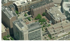
PENN Hospital Historical university hospital campus ~800,000sqft