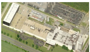
Kraft Foods - Richmond, VA Bakery & productions facility ~900,000sqft