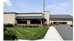
FCC Office - Gettysburg, PA FCC Satellite office ~250,000sqft