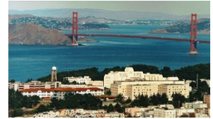
VA Medical Center - CA 7 building campus ~600,000sqft