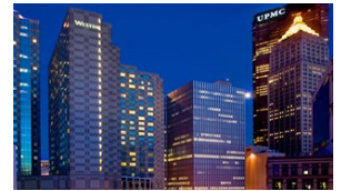
Westin - Pittsburgh, PA Office and hotel tower ~500,000sqft